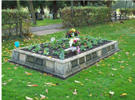
Western Memorial Gardens 1 & 2

Western cemetery offers two different styles of granite memorial plaque. Please indicate your preferred option.