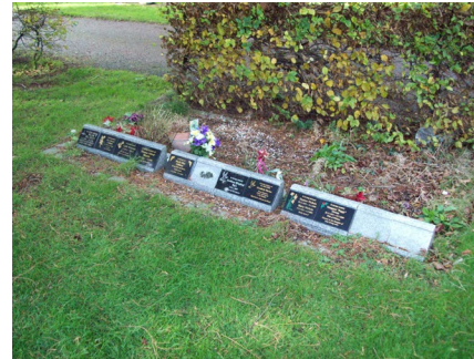
Western Memorial Garden 3